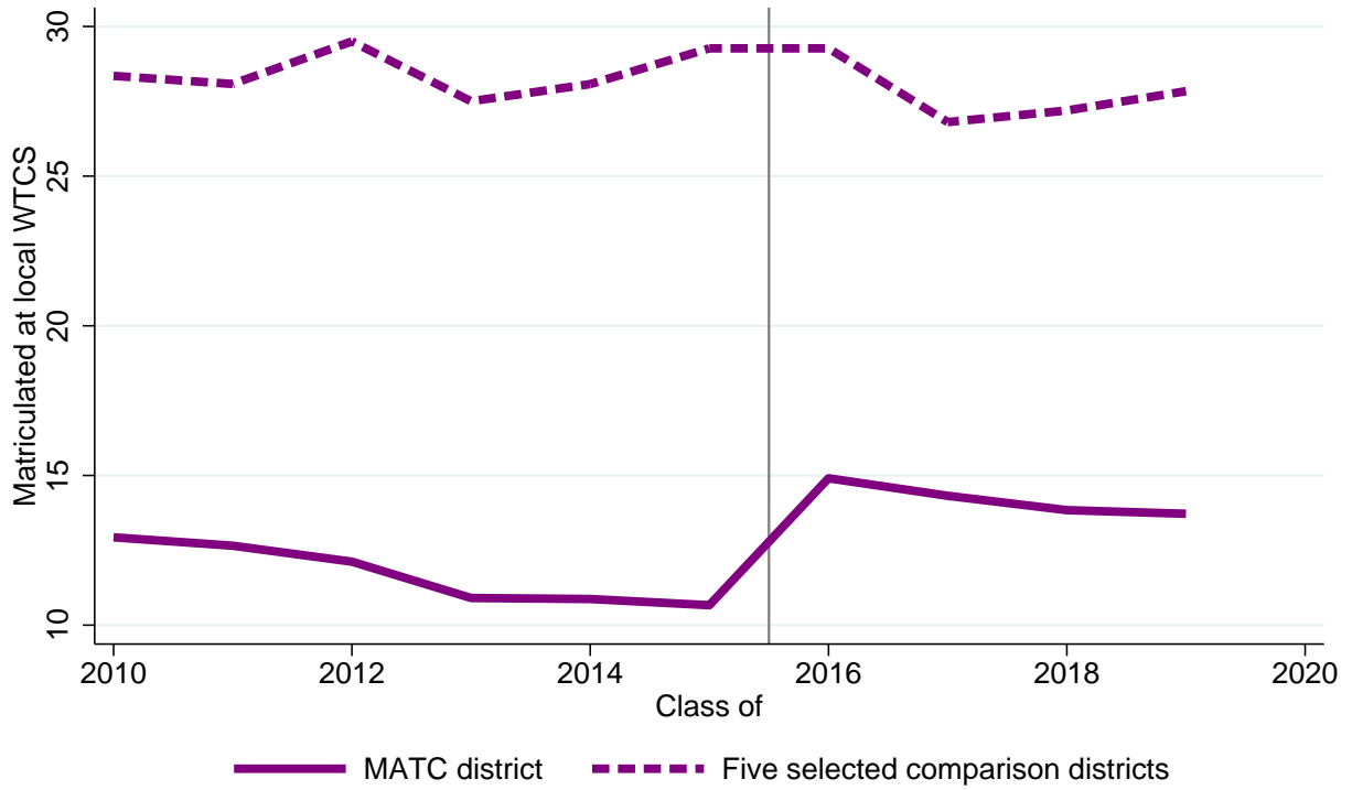
Figure 1: Matriculating to local technical college in MATC district and a comparison group of five selected technical college districts